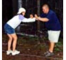
Wild Woozey, one of our team building elements.