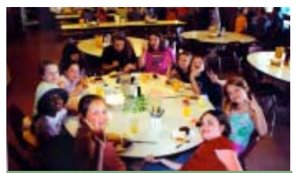
Ahhh, Good grub and fresh air, is there anything better?