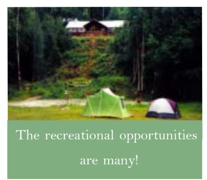
The recreational opportunities are many!