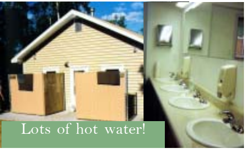
Lots of hot water!