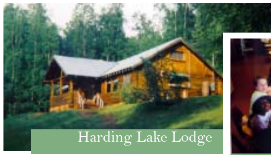
Harding Lake Lodge