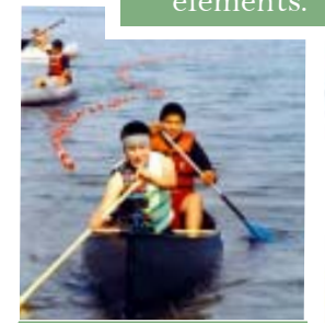
Canoeing on Harding Lake is relaxing and fun!