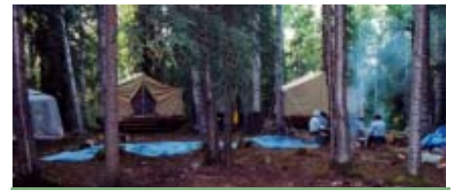
The Outback offers tent style camping for a group of 14.