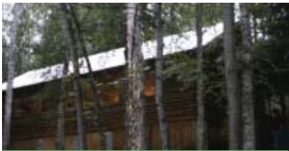
Billy Roberts Chapel